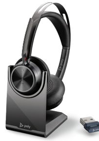
VOYAGER FOCUS 2 UC WITH CHARGE STAND