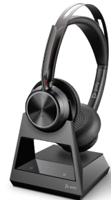
VOYAGER FOCUS 2 OFFICE