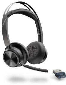
VOYAGER FOCUS 2 UC